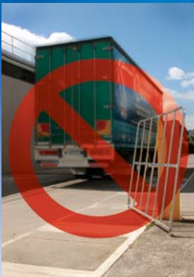
Eliminates the expense and inconvenience of gates being accidentally left behind