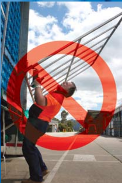
GateSkates take the load - not the operator - greatly reducing the risk of injury